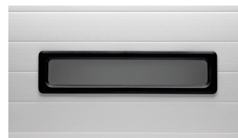
24" X 6" DOUBLE INSULATED ACRYLIC WINDOWS WITH BLACK FRAME