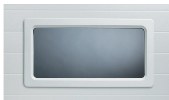
24" X 12" INSULATED GLASS Available with either a black or white frame.